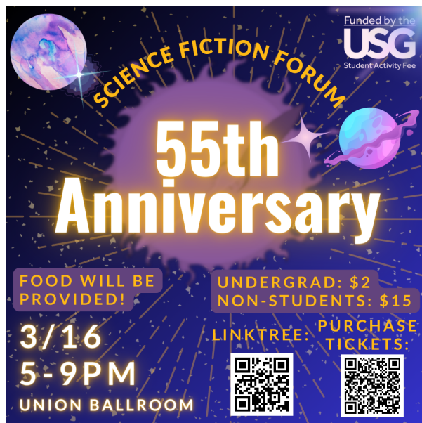
55th Anniversary - 3/16 @ 5-9PM Union Ballroom