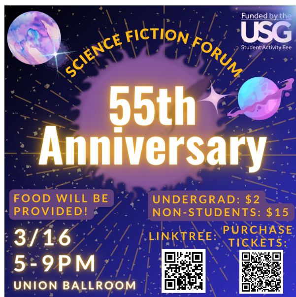
55th Anniversary - 3/16 @ 5-9PM Union Ballroom