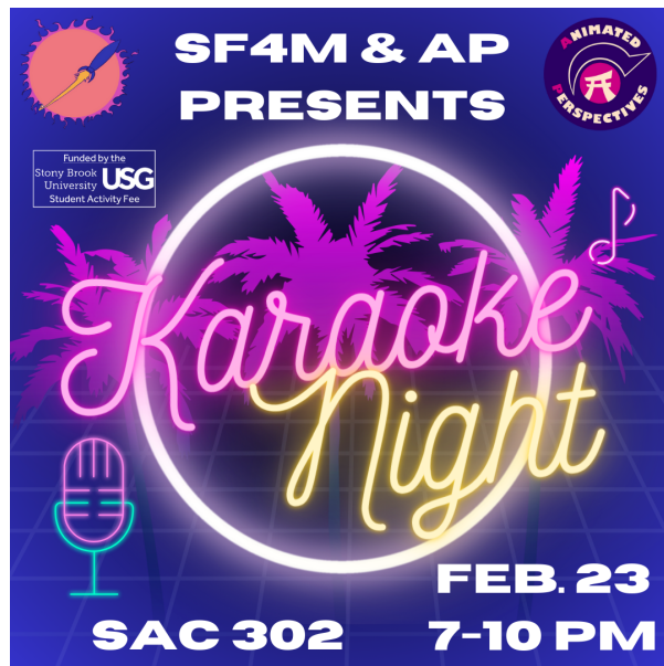
Karaoke Night with Animated Perspectives - 2/23 @ 7-10PM SAC 302